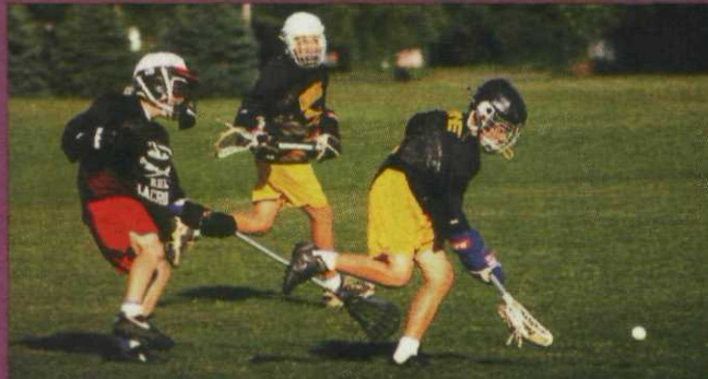
The Iroquois (eer-uh-coy) and tribes from the Eastern U.S. played lacrosse.

Have you ever seen people play lacrosse? Native Americans invented this sport. It is played all over the world. Players throw and catch a ball with special sticks.